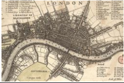
City of London